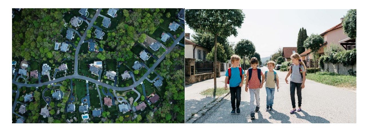
The Villages of Brookmont Neighborhood Watch Committee

The goal/objective of Neighborhood Watch Committee is to increase and maintain the safety of the VOB community by connecting neighbors to each other and looking out for suspicious activity.